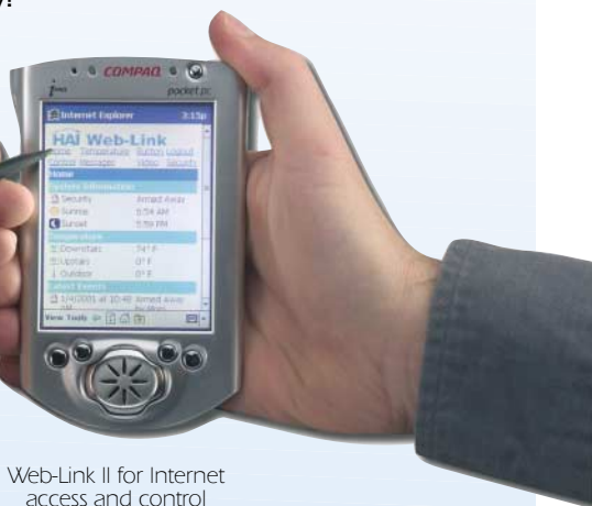
Web-Link II for Internet access and control

If you choose, you can access and control your Omni system over the Internet with HAI's Web-Link II software. Check on your house with video surveillance, verify the kids have arrived home from school with email notification, or disarm the security system for an arriving guest. Web-Link II makes it easy to stay connected to home and family!