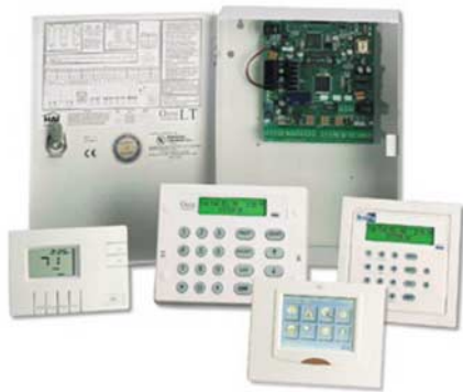
OmniLT with accessories

Your HAI Omni system is a fully functioning UL-listed security system— only smarter! Your Omni system monitors and alerts you of: intrusion, fire, carbon monoxide, freezing conditions, water leaks, etc. You can call in to your system to check on the status of your home or adjust lights and temperature.